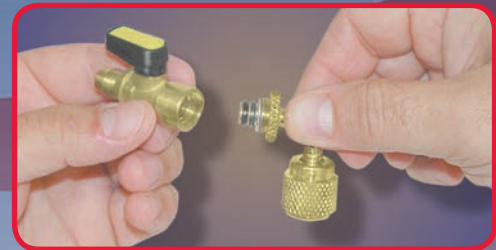
Universal Ball Valve with interchangeable Service Connectors

The Universal A/C Adaptor Kit box contains the most popular adaptors for servicing an A/C system, including a universal ball valve with interchangeable service connectors. Also included are replacement parts for R-123 and R-134a service hoses.