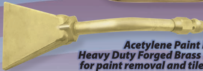
Acetylene Paint Burner PB29 Heavy Duty Forged Brass Burner: 2" wide flame for paint removal and tile cutting (UPC$43190)