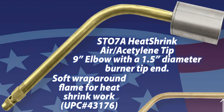
STO7A HeatShrink Air/Acetylene Tip 9" Elbow with a 1.5" diameter burner tip end.

Soft wraparound flame for heat shrink work (UPC#43176)