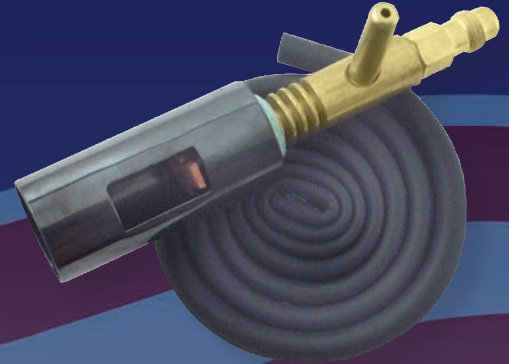
Halide Leak Detector Tip LD32 with probe hose for Air/Acetylene use (UPC#43200)

Soft wraparound flame for heat shrink work (UPC#43176)