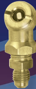
40045 Air Chuck