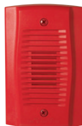
MHR UL S4011