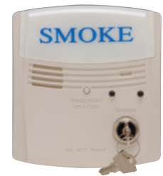
RTS2-AOS UL S2522