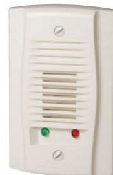
APA151 UL S4011