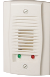
APA151 UL S4011