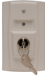
RTS151KEY UL S2522