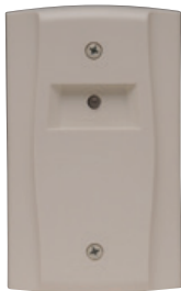
RA100Z UL S2522