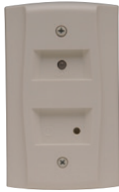
RTS151 UL S4011

System Sensor provides system flexibility with a variety of accessories, including two remote test stations and several different means of visible and audible system annunciation. As with our duct smoke detectors, all duct smoke detector accessories are UL listed.