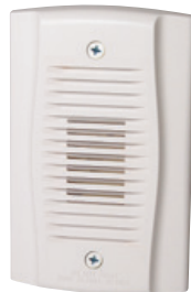
MHW UL S4011