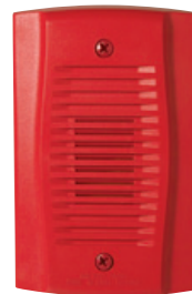
MHR UL S4011