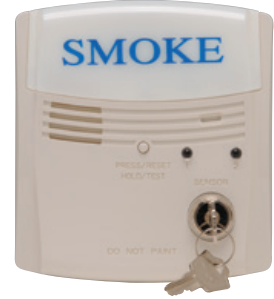
RTS2-AOS UL S2522