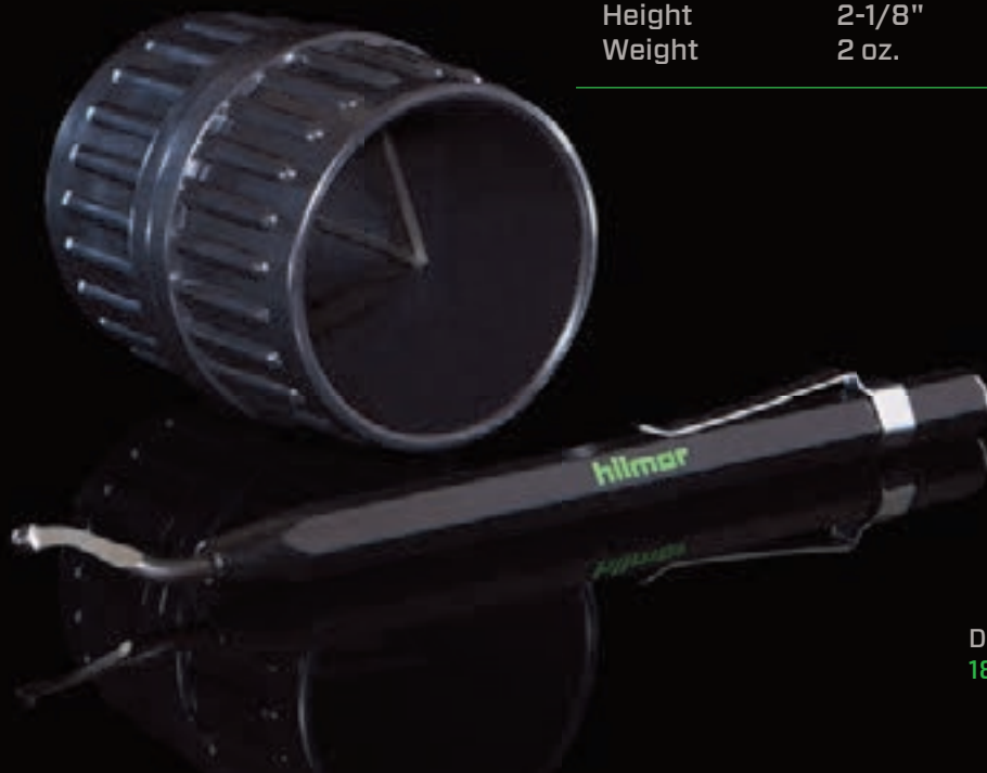
Deburrer, Pocket Size Deburring Tool 1839052, 1891258