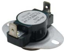
Limit Control Switches – Auto Reset (Large Flanged Airstream – 60T)