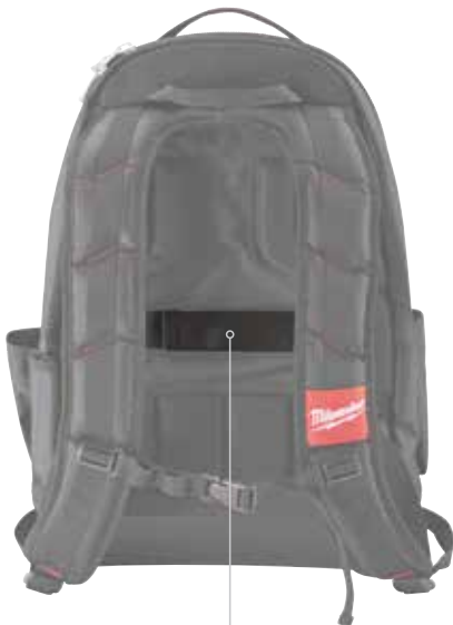
Attachment Strap For Rolling Luggage