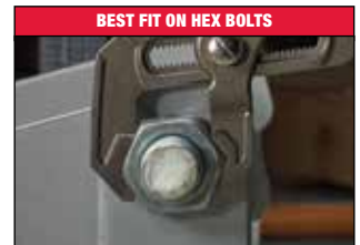
BEST FIT ON HEX BOLTS