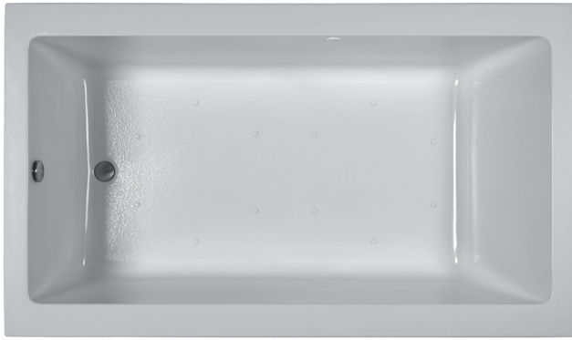
Shown as an air bath.