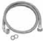
With 90° Elbow