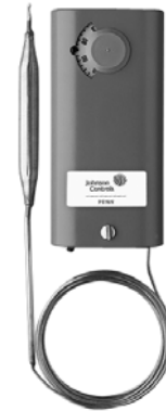
A19ABC-24 Remote Bulb Control