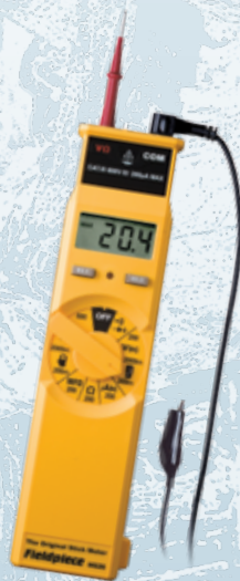
Original HS26 Also Available See Fieldpiece.com for details