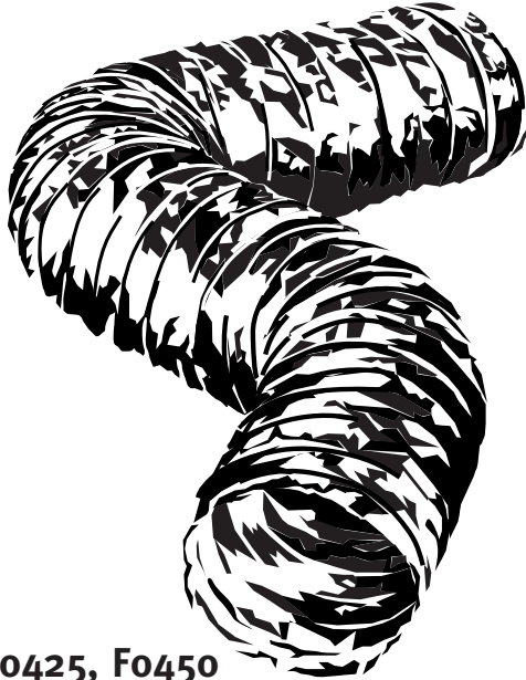
Fo420B, Fo425, Fo450