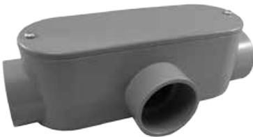
1/2" THROUGH 2"