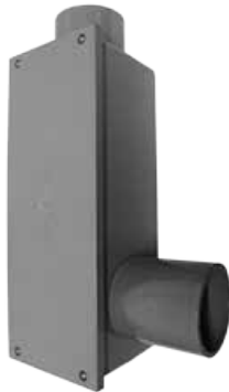
2-1/2" THROUGH 4"