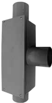
2-1/2" THROUGH 4"