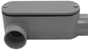
1/2" THROUGH 2"