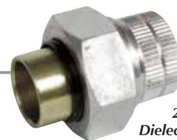
23503 Dielectric Union