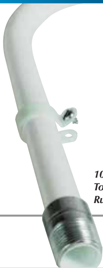
10962 Top Mount Runoff Tube