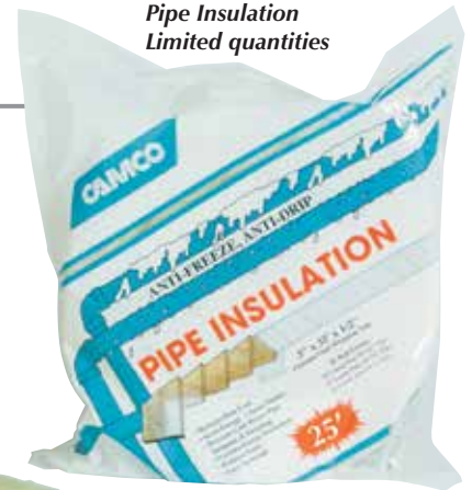
12660 Pipe Insulation Limited quantities