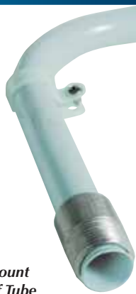
10952 Center Top Mount Runoff Tube