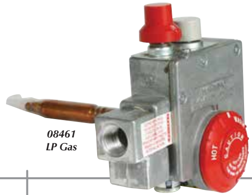
08461 LP Gas