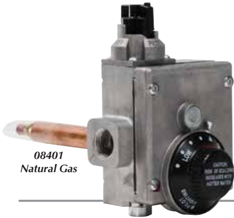
08401 Natural Gas