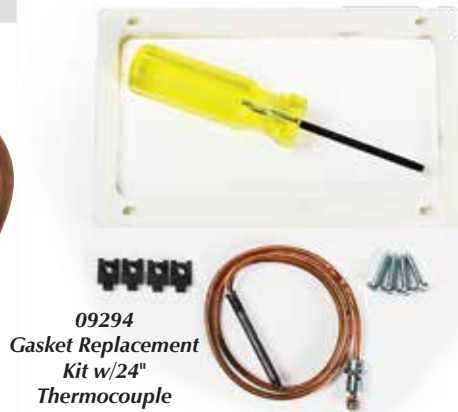
09294 Gasket Replacement Kit w/24" Thermocouple