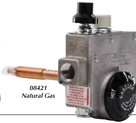
08421 Natural Gas