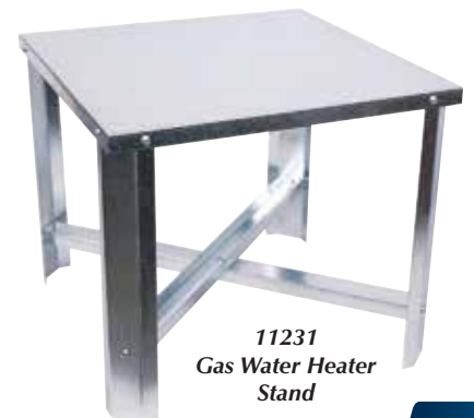
11231 Gas Water Heater Stand