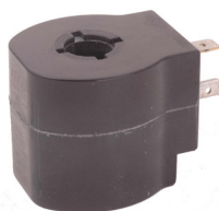
ASC2 – DIN

Requires ASC2 female connector (PCN 059261).