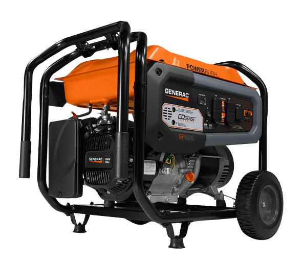
AC Rated Output Running Watts 6500 AC Maximum Output Starting Watts 8125