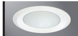
6150WH White Reflector

*UL1993 listed LED & CFL equivalent lamps permitted. Consult lamp manufacturer for conditions of use. Eaton does not warranty the lamp.