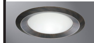
6150TBZ Tuscan Bronze Reflector