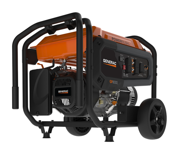
AC Rated Output Running Watts 8000 AC Maximum Output Starting Watts 10000