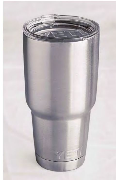
30 OZ TUMBLER