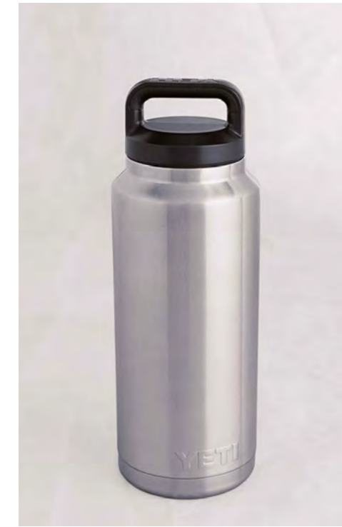
36 OZ BOTTLE