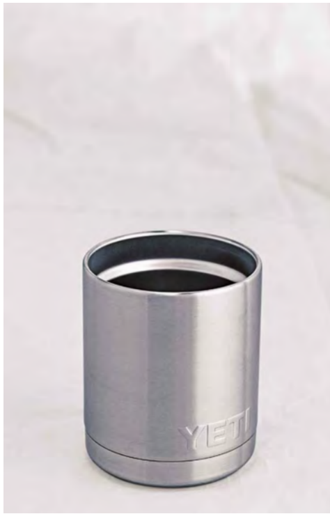
10 OZ LOWBALL