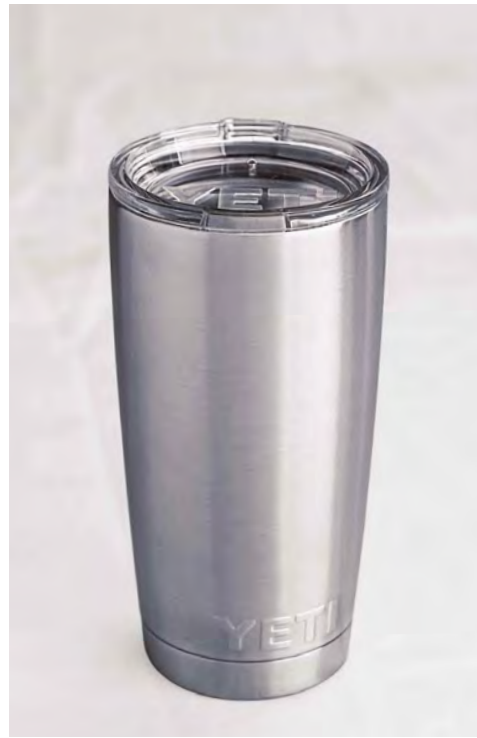
20 OZ TUMBLER