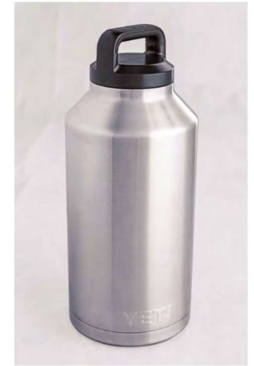
64 OZ BOTTLE