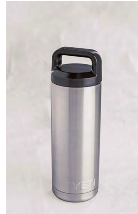
18 OZ BOTTLE

These cups are over-engineered from kitchen-grade 18/8 stainless steel with double-wall vacuum insulation to keep what you're sipping as cold or hot as science allows.