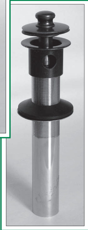
PUSH PULL® Model 800-PP with Overflow