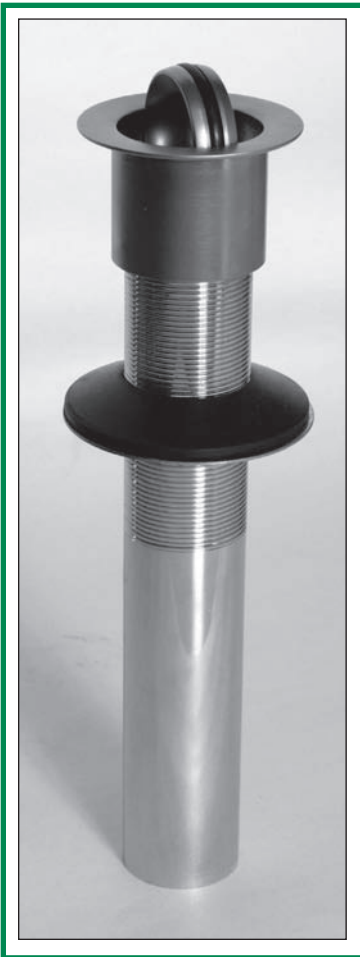
PRESFLO® Model 801-PF without Overflow