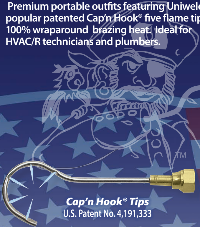
Cap'n Hook® Tips U.S. Patent No. 4,191,333