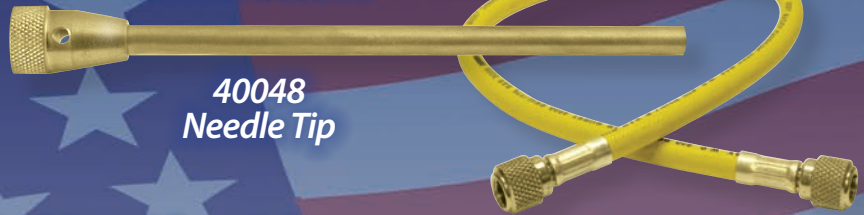
40048 Needle Tip