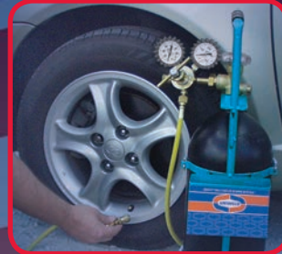
Inflate tire with the Sludge Sucker® Air Chuck