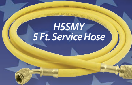
H5SMY 5 Ft. Service Hose