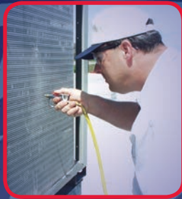
Blow off coils with Sludge Sucker® Blowgun

A versatile, all-in-one kit that includes a Nitrogen regulator with a delivery pressure up to 400 PSI for pressure testing an A/C&R system for leaks. It also includes many accessories for cleaning condensate drain lines and for blowing off coils. It even has a air chuck to fill up that flat tire. As a bonus, our Sludge Blaster® is included (see page 80 for more information). Carry stands are sold separately (see page 41).