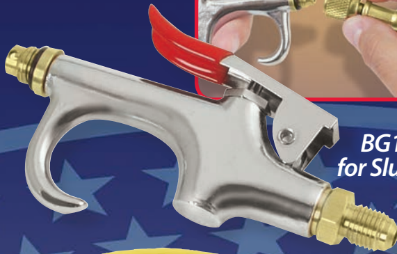
BG1 Blowgun for Sludge Sucker® Kit