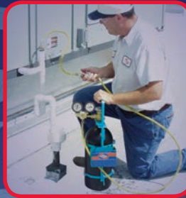
Clean condensate drain lines with the Sludge Blaster®