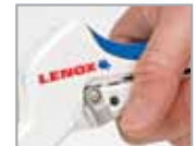
Easy Open & Close