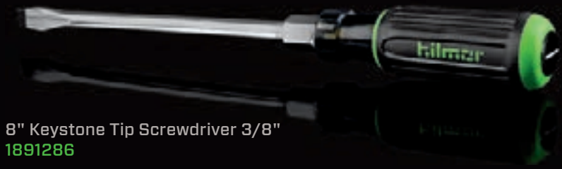
8" Keystone Tip Screwdriver 3/8" 1891286

Designed to last with a heat-treated, chrome-plated shaft.