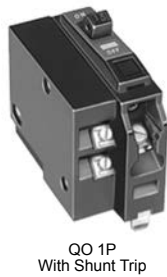
QO 1P With Shunt Trip

QO-EPD/EPE circuit breakers provide overload and short circuit protection combined with Class B ground fault protection. They are designed to provide ground fault protection of equipment at a 30 mA level (EPD) or 100 mA level (EPE). They are not designed to protect people from electrical shock.