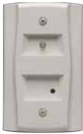
RTS151 UL S4011

System Sensor provides system flexibility with a variety of accessories, including two remote test stations and several different means of visible and audible system annunciation. As with our duct smoke detectors, all duct smoke detector accessories are UL listed.