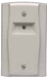
RA100Z UL S2522