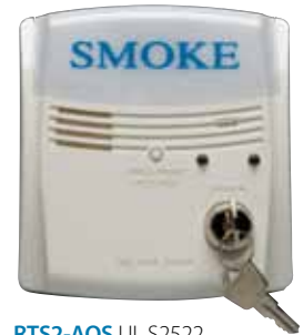
RTS2-AOS UL S2522