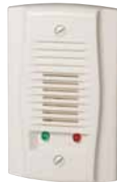
APA151 UL S4011