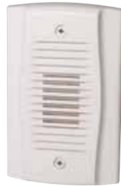
MHW UL S4011