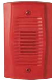
MHR UL S4011