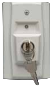
RTS151KEY UL S2522