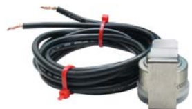
Limit Control Switches/Defrost Sensors – Auto Reset (Tube Mount – 14T / 37T)