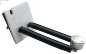
Limit Control Switches – Auto Reset (Board Mount 60 Degree Strap Angle – 36T)