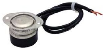
Limit Control Switches – Auto Reset (Flanged Surface Mount – 14T)