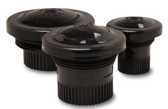
Patent No. 9,416,986 B2; 9,010,363; 9,139,991

Waterless in-line floor drain trap seal / backwater protection.