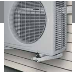
Shown in Stainless