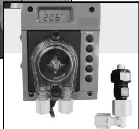
DR-2000™ Automated Air Deodorizer & Spray Tip