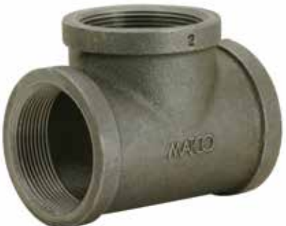
Sample Part # is: Chinese Malleable Black, 150LB, Tee, 2"