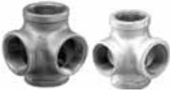
MATCO-NORCA MODEL NUMBER BLACK GALVANIZED SIZE CARTON QUANTITIES INNER MASTER