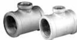
MATCO-NORCA MODEL NUMBER BLACK GALVANIZED SIZE CARTON QUANTITIES INNER MASTER