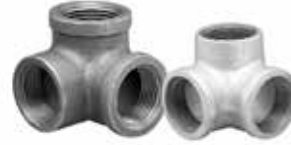
MATCO-NORCA MODEL NUMBER BLACK GALVANIZED SIZE CARTON QUANTITIES INNER MASTER