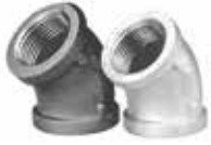
MATCO-NORCA MODEL NUMBER BLACK GALVANIZED SIZE CARTON QUANTITIES INNER MASTER