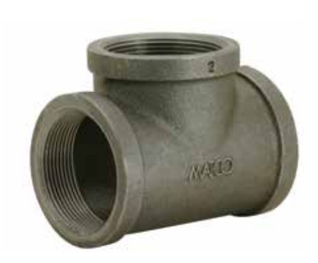
Sample Part # is: Chinese Malleable Black, 150LB, Tee, 2"