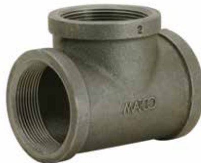
Sample Part # is: Chinese Malleable Black, 150LB, Tee, 2"