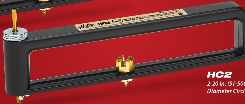
HC2 2-20 in. (51-508 mm) Diameter Circles