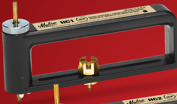
HC1 2-12 in. (51-305 mm) Diameter Circles