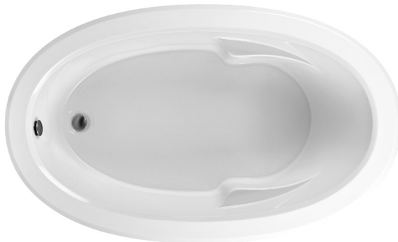
Features integral armrests.