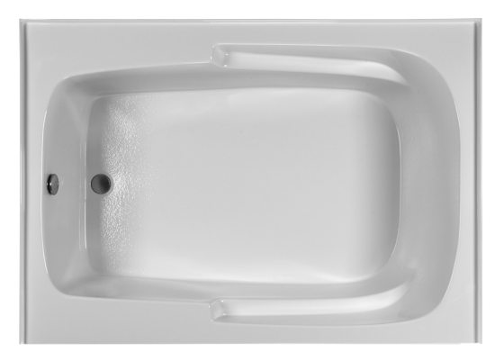
Features integral front skirting, armrests & tile flange on 3 sides.

Model MTXXXX Made in USA Complies with ANSI Z124.1-1995