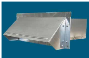
10" x 3¼" Aluminum Wall Vent w/Damper