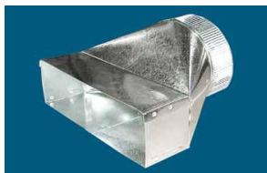
# 201V Adapter 10" x 3¼" x Size Noted