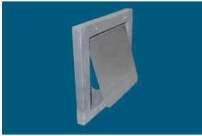
Flush Mount Vents