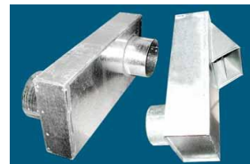
K & S Slab Vent 10" x 3¼" x 22" w/6" Collars