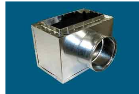
# 648 Register Box 9" Tall w/Side Outlet Insulated R-4