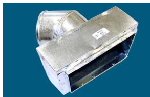
# 645 Adjustable 45° Collar, w/Snap-Rail Flange, Insulated R-4