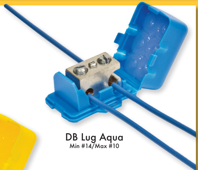
DB Lug Aqua Min #14/Max #10

SKU# 90120 DB Lug Yellow- Bag of 5 SKU# 90220 DB Lug Aqua- Bag of 5