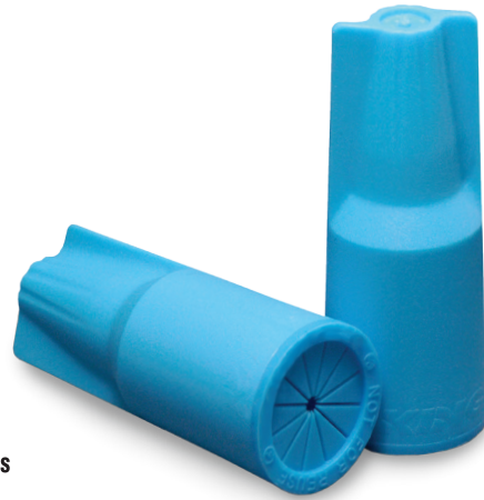
King 6 Blue Min #22/Max #8

SKU# 10666 King 6 Blue- Bag of 10 SKU# 31556 King 6 Yellow- Bag of 10