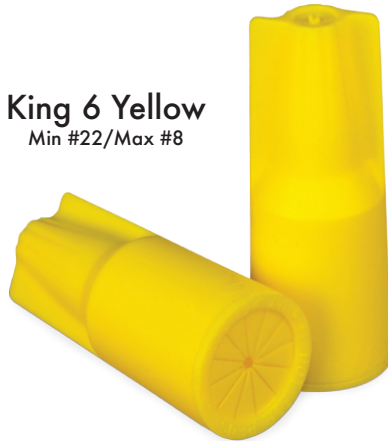
King 6 Yellow Min #22/Max #8