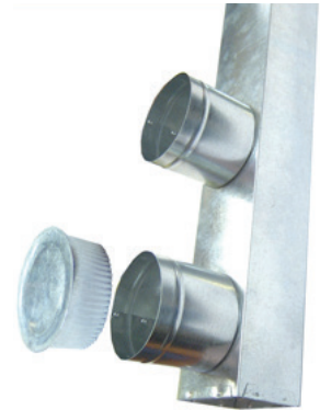
V5310C 4"x3" Vent with cleanout and cap