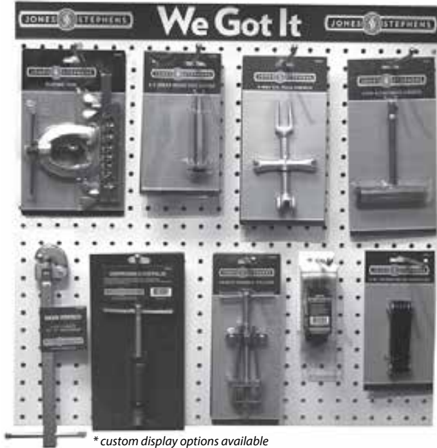
* custom display options available