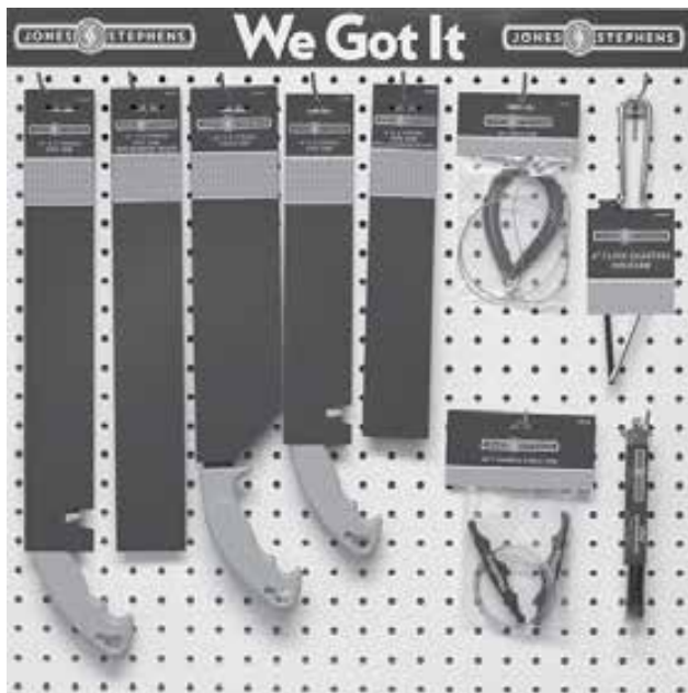
* custom display options available