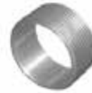
MIP x FIP