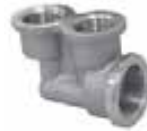
FIP x FIP