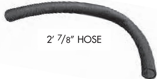
2' 7/8" HOSE