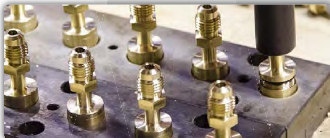
Access valve manufacturing