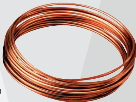
TC-26-16 Short coil capillary tubing

Short coils are boxed with application charts. Cut from 100' (30.5 m) sealed and dehydrated tube. S/B 100' (30.5 m) coils are boxed with conversion and application charts.