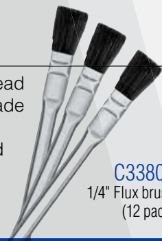
C33804 1/4" Flux brush (12 pack)

Our acid brushes are ideal for thread sealant, flux, and past solders. Made of 100% long and stiff horsehair bristles that are evenly placed and securely crimped into tinned acid-resisting handles.